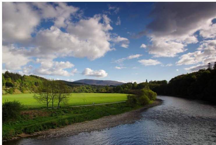
View of the River Spey