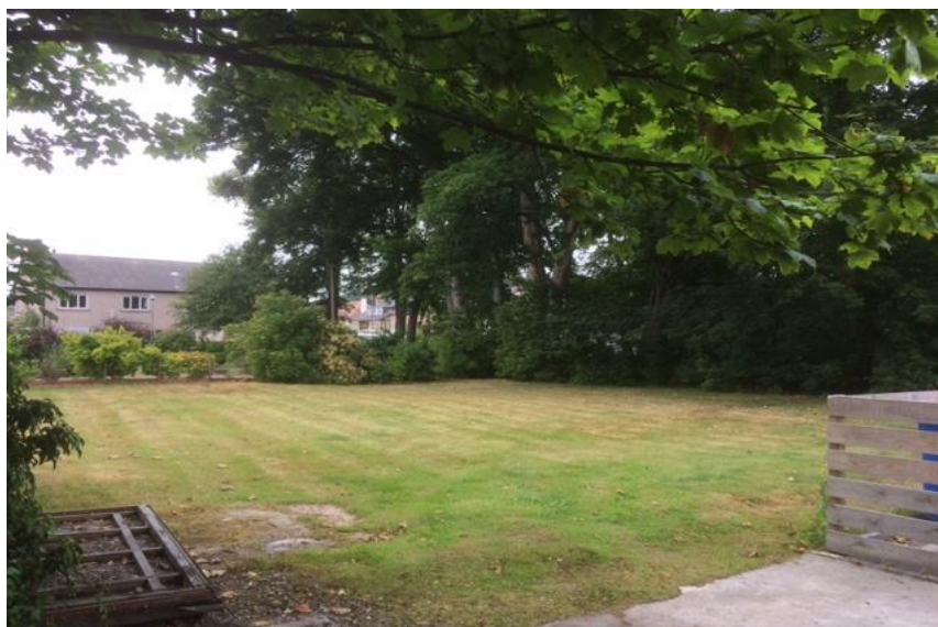
Garden area to side of Manse