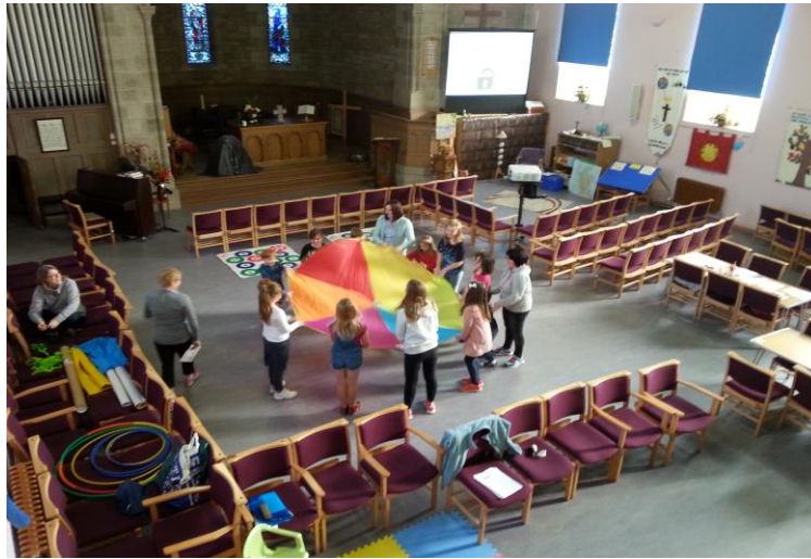
Holiday Club in Aberlour Church 2016

Messy Church is temporarily on hold, but it is hoped that we will be able to recommence this activity in the near future.