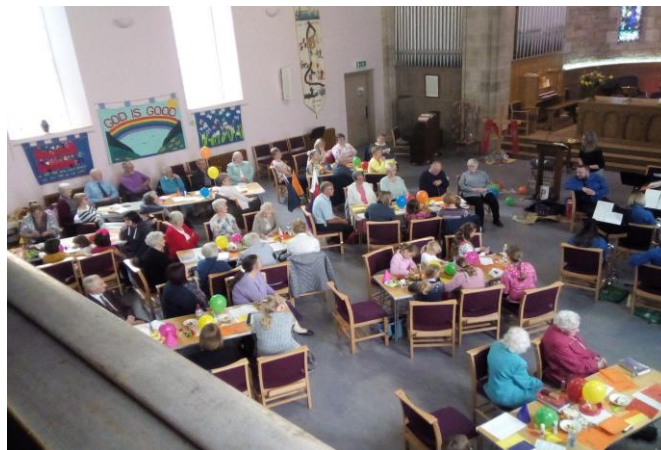
Pentecost celebrations in Aberlour Church 2017

Special services take place during Holy Week, Christmas, Thinking Day, Remembrance Sunday, Guild Week, Christian Aid Week, Holiday Club, Harvest and at Pentecost. Along with other local churches, Aberlour Parish Church also provides services and pastoral care at the local residential home on a regular basis.