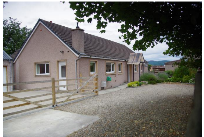
Front entrance to Manse